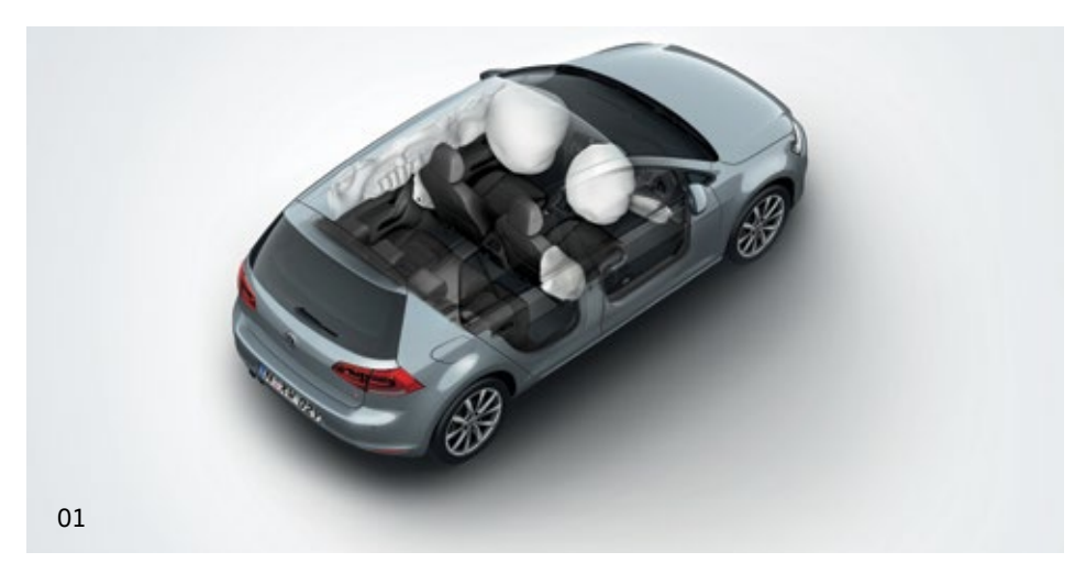
01 Front, front side, curtain and driver's knee airbag (7)^

Safety is paramount, but in-cabin technology goes a long way to making every trip a pleasurable one. Rear View Camera* makes parking a breeze, while the intuitive 8-inch infotainment system with App-Connect<sup>~</sup> puts a world of information and entertainment at your fingertips. Volkswagen's class-leading technology is no more evident than in its Active Info Display (part of the optional Sound and Vision Package), a ground breaking addition to the Golf that will forever change how driver and car interact.