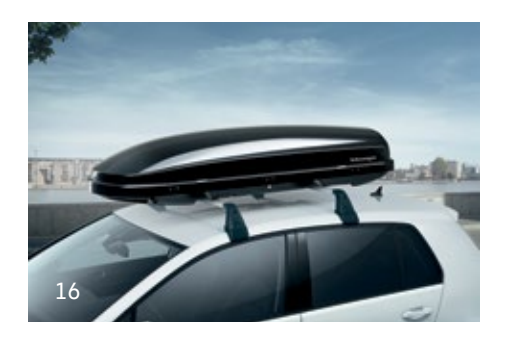
Overseas models are shown for illustrative purposes only. Optional accessories at extra cost. Please note that the above accessories may have an effect on fuel efficiency. Items such as sports equipment and tablets are shown for illustration purposes only and are not available for purchase from Volkswagen Group Australia or its Dealers. For a full range of Volkswagen Genuine Accessories, please refer to the accessories tab at www.volkswagen.com.au or visit an authorised Volkswagen Dealer.